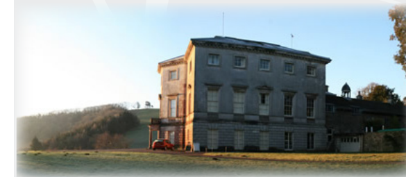
Sharpham House, Devon, UK