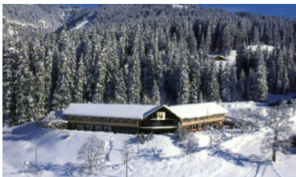
Meditation Center Beatenberg, Switzerland